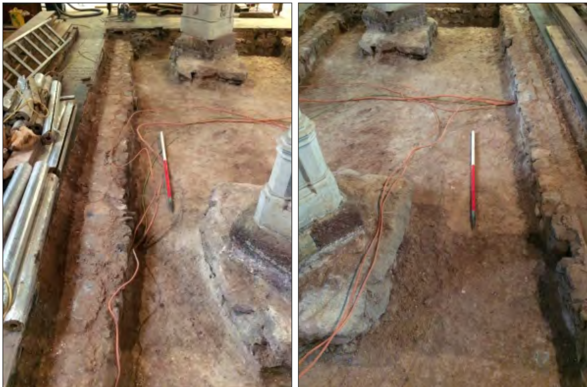
Fig. 2 Plan showing location of observations and photos showing 19th century lime screed with low walls walling supporting timber flooring and pews.