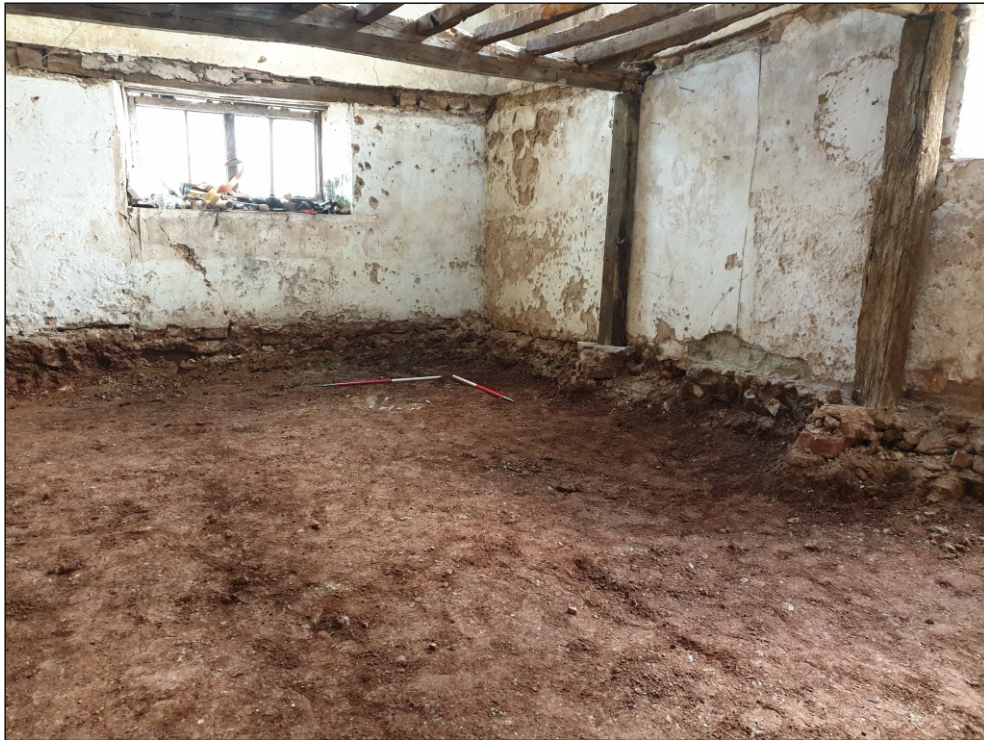
Pl. 1 General view of north wing showing reduced levels. 1m scales. Looking northeast.