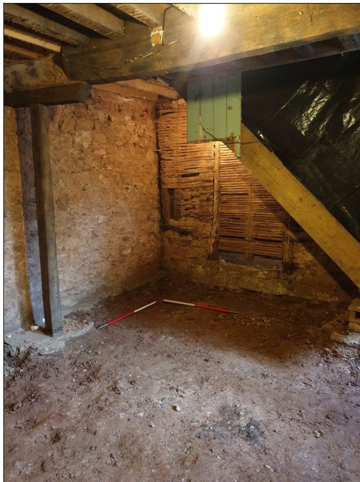
Pl. 2 General view of former kitchen showing reduced levels. 1m scales. Looking northeast.