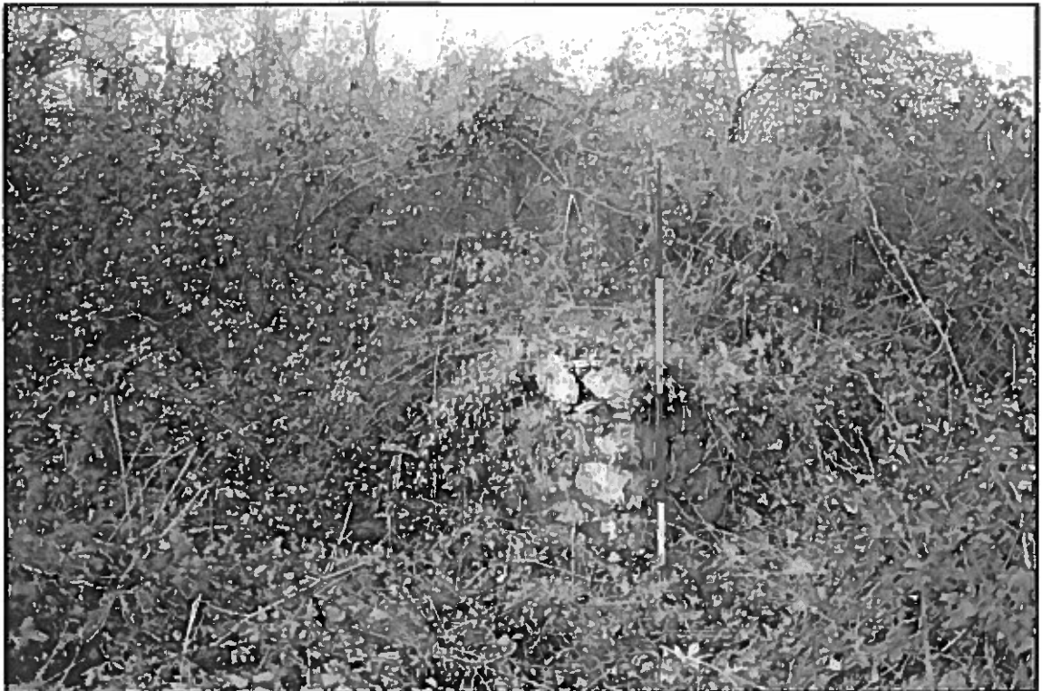
Pl. 2 South-east corner of stone building. View to north-west.