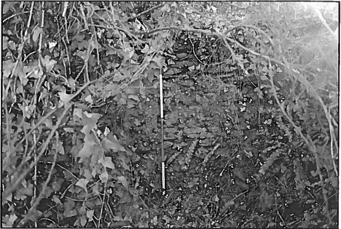
Pl. 1 Section of curved stone walling which may represent remains of former limekiln. View to south.