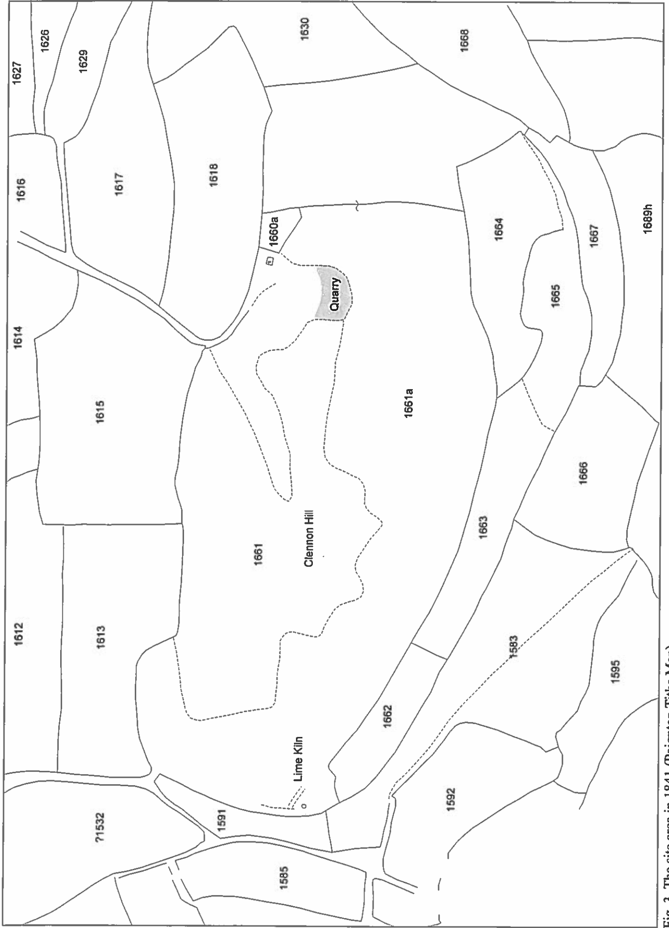
Fig. 3 The site area in 1841 (Paington Tithe Map).